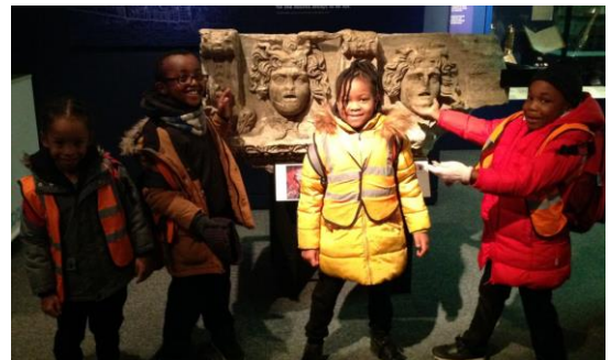
Year 1 & Year 2 D&T Project

Thank you to all the parents and the children who brought in recycled materials for the Year 1 and Year 6 Design and Technology projects.